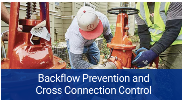
Backflow Prevention and Cross Connection Control

More than ever, optimizing your workforce and asset performance is imperative to providing safe, responsive, and cost-effective systems of water and wastewater service delivery. KloudGin is leading the way with digital transformation for water utilities by providing a library of modern mobility solutions that automate workforce scheduling, resource planning, asset management and compliance reporting.