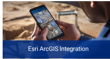
Esri ArcGIS Integration