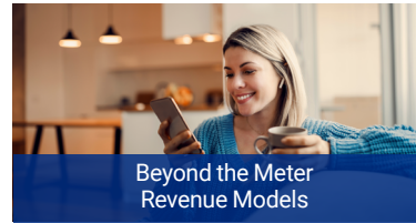
Beyond the Meter Revenue Models