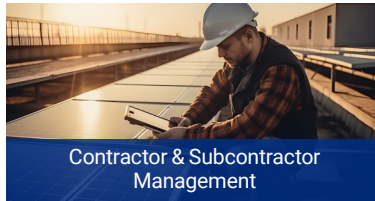
Contractor & Subcontractor Management