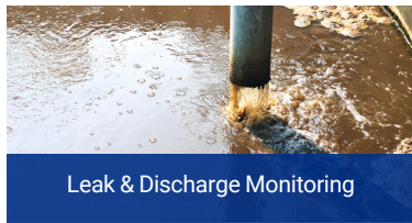
Leak & Discharge Monitoring