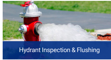
Hydrant Inspection & Flushing